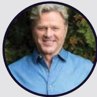
GUEST SPEAKER DERMOTT BRERETON