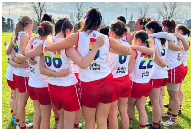
South Melbourne Districts