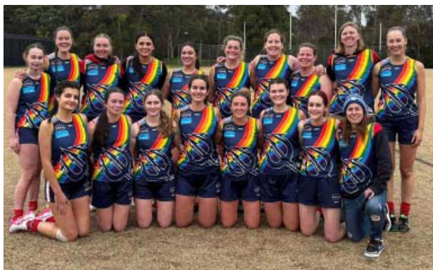
Box Hill North