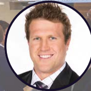
GUEST SPEAKER CAMPBELL BROWN