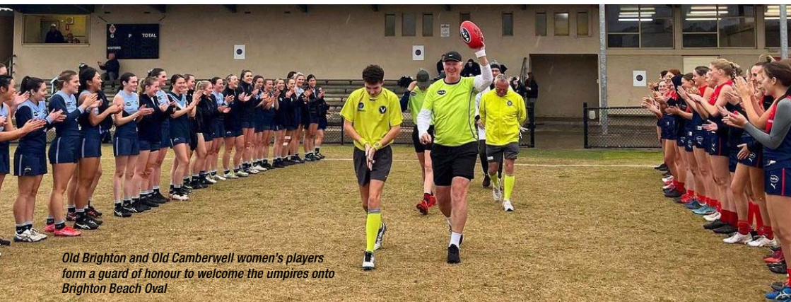
Old Brighton and Old Camberwell women's players form a guard of honour to welcome the umpires onto Brighton Beach Oval