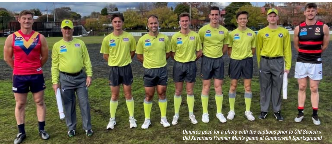
Umpires pose for a photo with the captains prior to Old Scotch v Old Xavierians Premier Men's game at Camberwell Sportsground

Last weekend, the VAFA celebrated Community Umpiring Week. It was great to see many VAFA clubs recognise the umpires, including forming a guard of honour as they entered the ground, playing shaking their hands and/or posing for photos prior to the first bounce, and recognising them in the post-match awards.