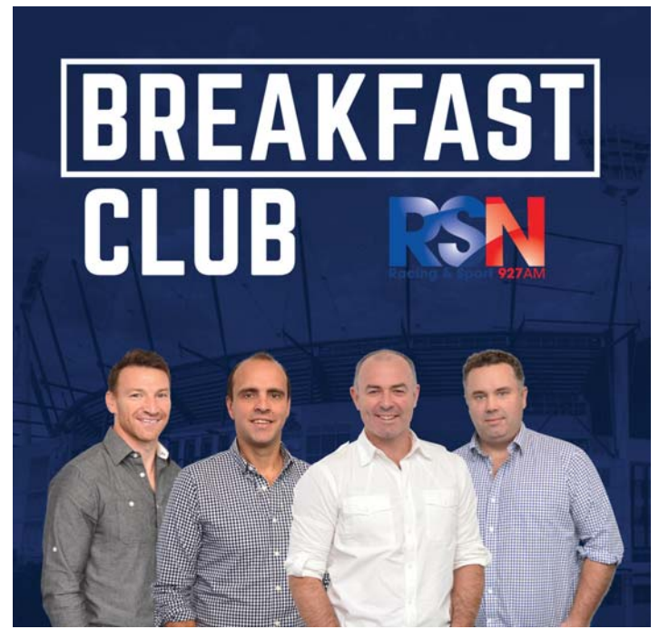
"The Breakfast Club - Monday to Friday - 6am to 8.30am"

Hear the VAFA William Buck Premier match of the day on RSN Carnival every Saturday. Kicking off with the For the Love of the Game podcast from 12pm, the live pre-game from 1pm and the first bounce at 2pm. Uninterrupted until 5pm.