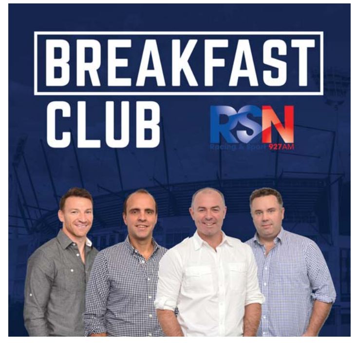
"The Breakfast Club - Monday to Friday - 6am to 8.30am"

Hear the VAFA William Buck Premier match of the day on RSN Carnival every Saturday. Kicking off with the For the Love of the Game podcast from 12pm, the live pre-game from 1pm and the first bounce at 2pm. Uninterrupted until 5pm.