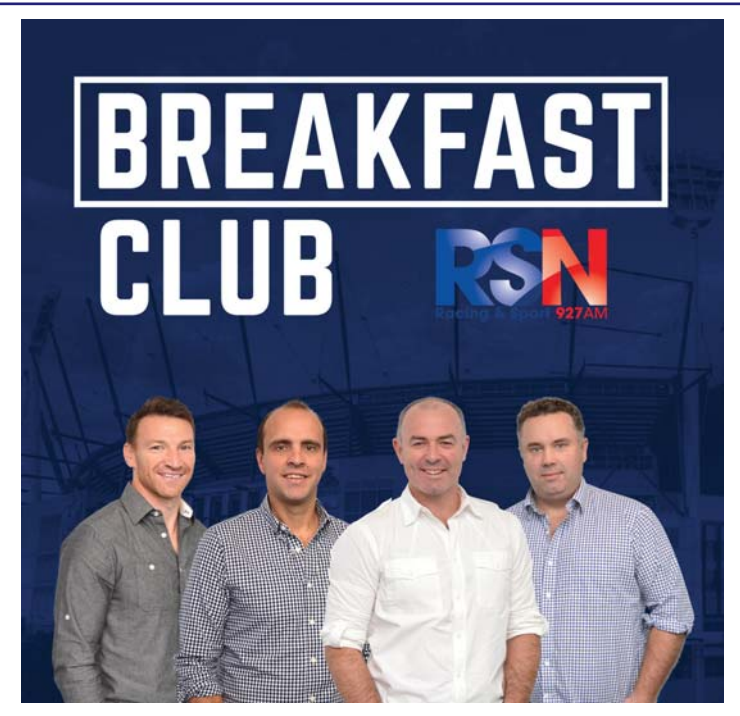
"The Breakfast Club - Monday to Friday - 6am to 8.30am"

Hear the VAFA William Buck Premier match of the day on RSN Carnival every Saturday. Kicking off with the For the Love of the Game podcast from 12pm, the live pre-game from 1pm and the first bounce at 2pm. Uninterrupted until 5pm.