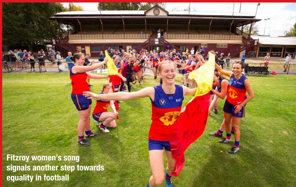
Fitzroy women's song signals another step towards equality in football

70 years after the Fitzroy Football Club's famous old theme song was first penned, the club will write another page in its illustrious history when the Roy Girls run out onto the Brunswick Street Oval to the strains of their own version of the song in Season 2022.