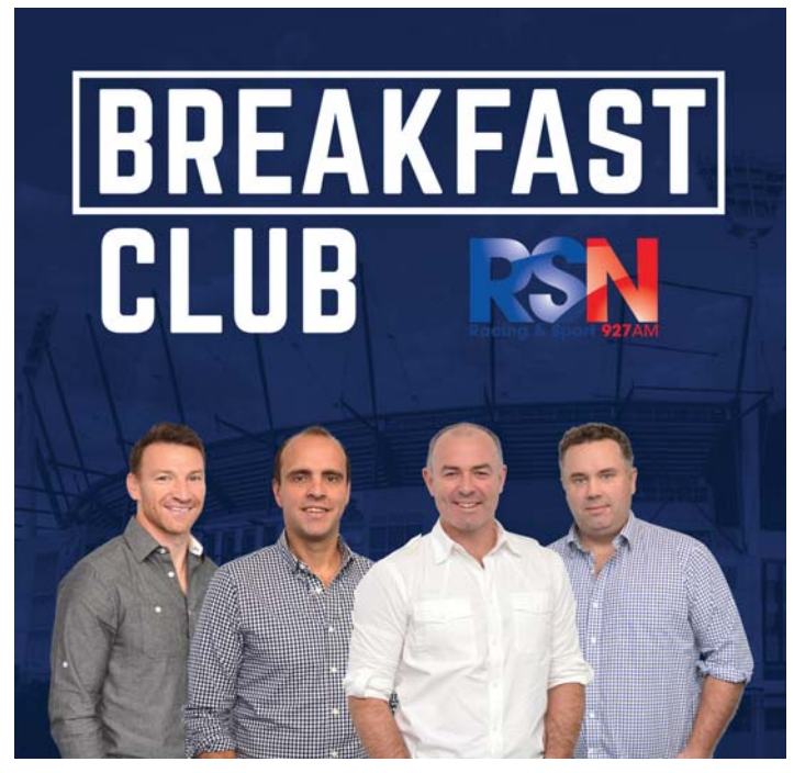
"The Breakfast Club - Monday to Friday - 6am to 8.30am"

Hear the VAFA William Buck Premier match of the day on RSN Carnival every Saturday. Kicking off with the For the Love of the Game podcast from 12pm, the live pre-game from 1pm and the first bounce at 2pm. Uninterrupted until 5pm.